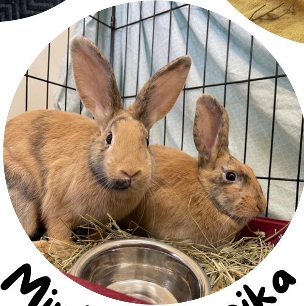
Mint & Paprika