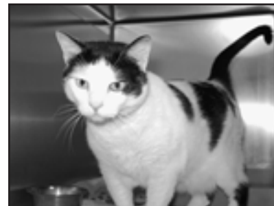
Tubbie is a Cautious Cat

Tubbie, our International Cat, has been at the League almost five months. Her family brought her all the way from Italy, but then couldn't keep her. She is a five year-old spayed female, up to date on shots, who was brought to the shelter in March. She is a very cautious girl so be prepared to be patient with her. Once she gets to know and trust you she can be quite affectionate. She is a playful girl when she is comfortable and can get a little feisty when she is worked up. She is looking for a calm home with only adults or older children.