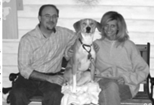
Blossom & Family After Advanced Obedience