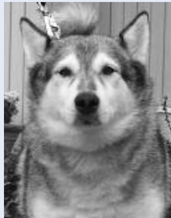
Eliza, one of the 229 dogs taken in by the ARL in 2007.