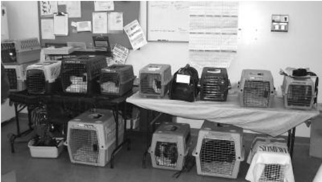
Spayapalooza® clients lined up on clinic day – we invested $5,975 in spay/neuter for pets of low-income families in 2007

If you are interested in donating to this program, please contact our office manager Marianne Jones at 603-472-3647 or marianne@rescueleague.org .