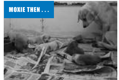
Moxie, our first transport dog, in the Mississippi shelter before coming to NH.

As you learned earlier in this report, we piloted our dog transport program in 2007. This year we hope to continue the program (saving more dogs and puppies facing euthanasia in the South), build awareness of our needs for special construction work to create an on-site self-contained quarantine area (currently dogs are quarantined off site), and begin fundraising for this construction effort, which will be a big project in 2009.