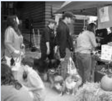
Supporters registering during our 4th Annual PetStep.

Each year, the staff and volunteers at the ARL strive to outdo the totals of the fundraisers from the year prior. Each year we raise more and more money through events and fundraisers for the League. 2007 was an extremely successful year, with the fundraising staff raising $315,620 for the