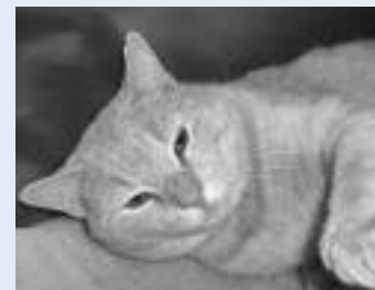
Bubba, one of the 713 cats taken in by the ARL in 2007.

Humane education sessions: 347. Humane ed students reached: 8,463 children/teens, 2,463 adults.