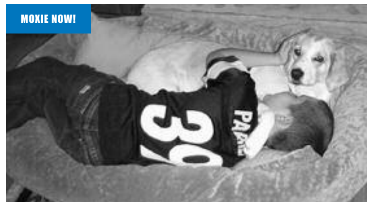
Moxie with her new owner's grandson (whose family adopted a puppy from our second transport!)

Top 5 towns for incoming animals: Manchester (36.3%), Bedford (13.9%), Merrimack (6.4%), Milford (5.2%), Goffstown (4.3%). Towns served: 56.