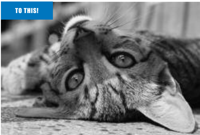
An adoptable cat enjoying the sun while waiting for her new owners.

Currently, a member of our staff must carry a cat through the small animal room (stressful for both cats and small animals) and into a small get-acquainted room. At busy times there is a wait for the rooms, and the process can be inefficient. We are hoping that our new center, which should be completed this summer, will create happier cats and a more pleasant adoption experience! We hope that you will visit the Center and give us your feedback – we'll let you know when we have the grand opening!