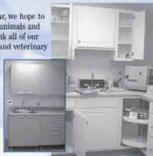
Photos of the ARLNH's brand-new clinic, waiting to serve the homeless animals of New Hampshire.

In the coming year, we hope to assist even more animals and would like to thank all of our generous donors and veterinary partners in their continued commitment to our mission.