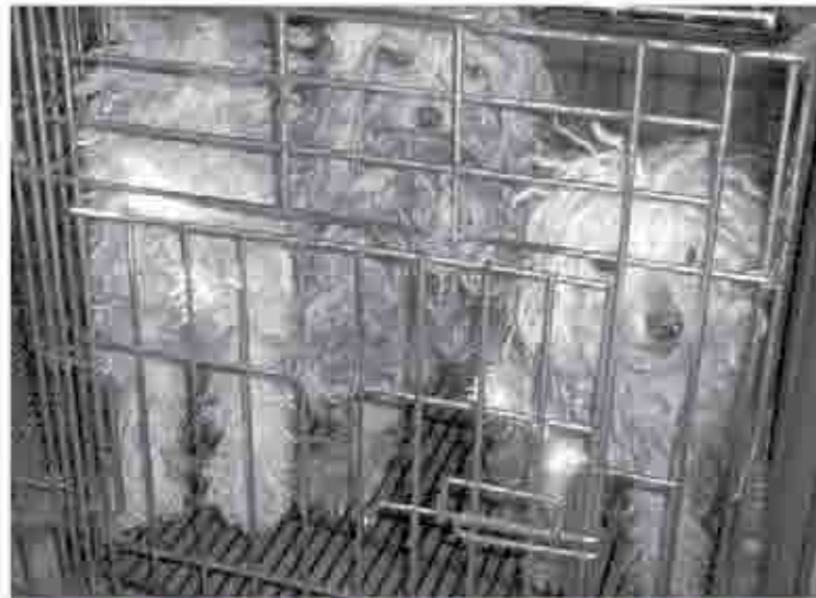
Cramped into tiny living spaces and no where to turn, 44 dogs came to the League in the hopes of better lives.

A few months later the League received custody of most of the remaining dogs and after quite a bit of needed veterinarian care, they were quickly placed into the homes of adopters that were anxiously waiting for them to be available. As the weeks went on the staff continued to get updates from our new adopter friends. After each update received the news would be shared with the rest of the staff of how one dog learned to walk down stairs and how another learned to run. Many of the adopters joined an email group for the Mont Vernon 44 and still share stories and advice with each other. We hosted an open house in October and had a mini-reunion where many of these families came to meet other parents of the dogs and give them a chance to play together.