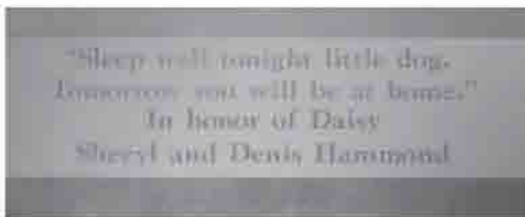
The kennels purchased in perPETuity are complete with a message from the donors who named them.