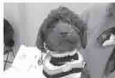
All these dogs were formerly living in squalid conditions. As you can see now, they are spoiled with love and completely doted on by their new parents.