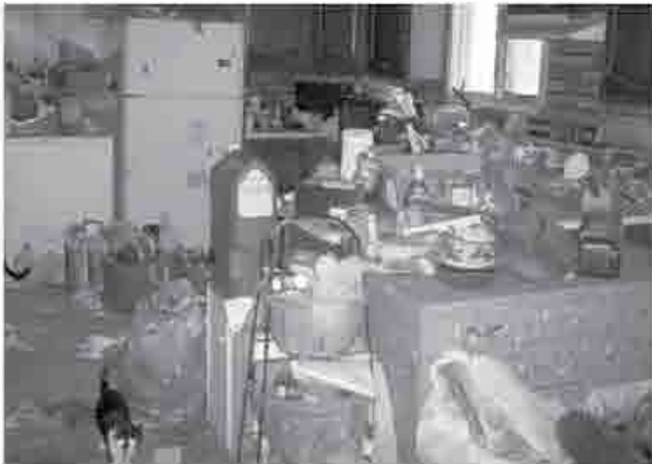
Photos taken while removing multiple cats from a boarding house in Bethlehem.

In 2010, our outreach program reached 152 animals from this area of the state, including 118 animals from the town of Berlin alone. Other areas of assistance include our Food Pantry program. Whenever our coordinator is making a trip up north, she will typically fill our vehicle with as much food from our Food Pantry supplies as possible and will make arrangements with different individuals at different drop off locations so we know the food is then being delivered specifically to the families needing it the most.