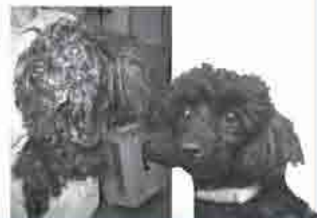
Sara before and after.